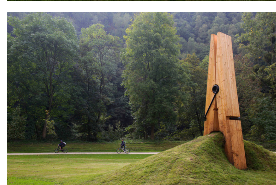
Community /Cultural Hub